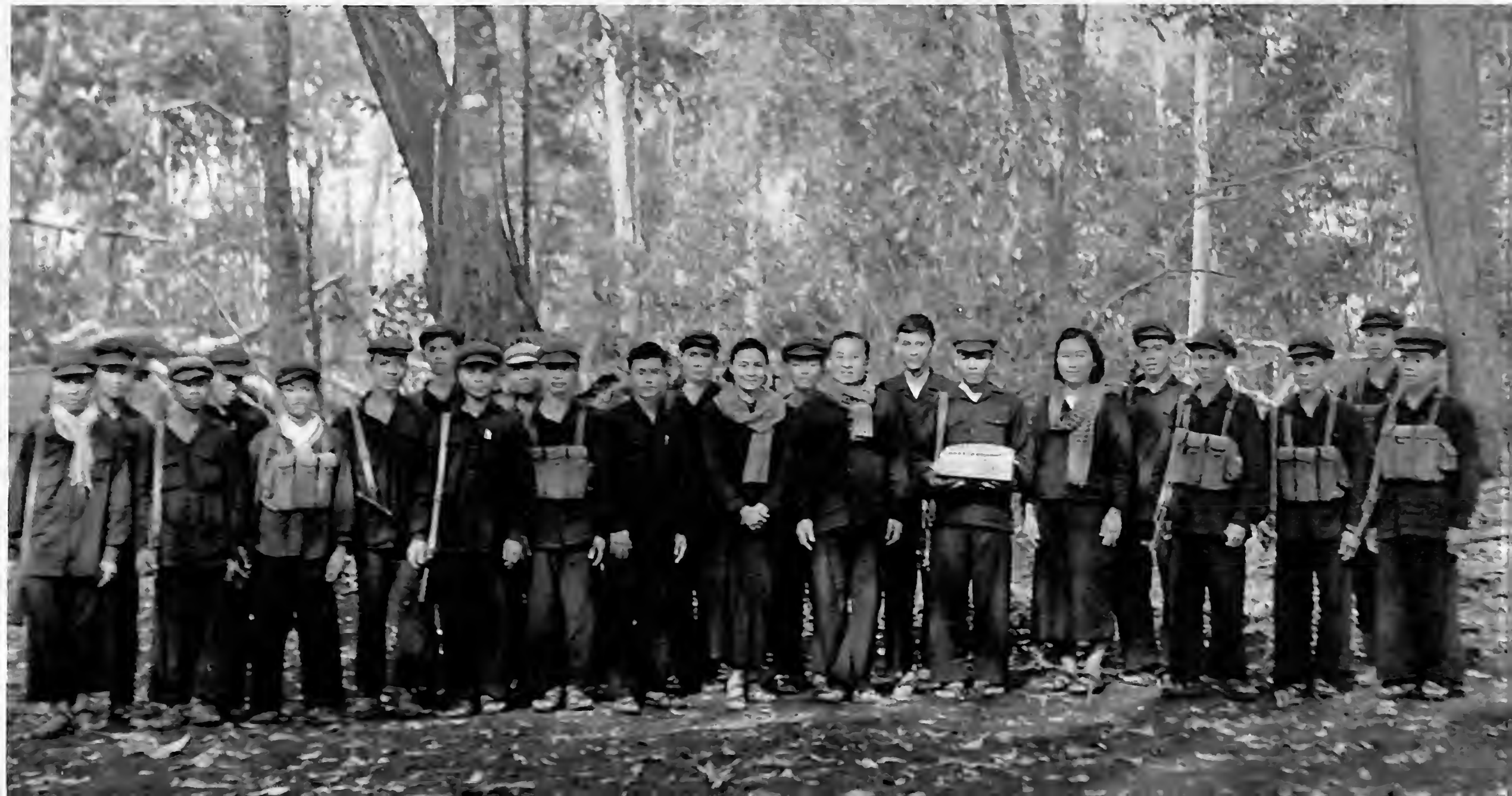
Samdech and Madame Sihanouk with fighter-escorts.